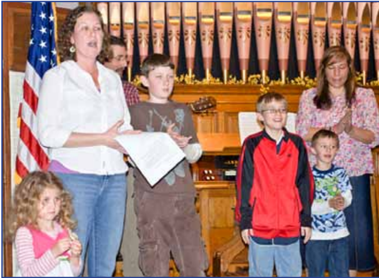
At the Whole Church worship for Earth Day, the children's religion class led us in song.